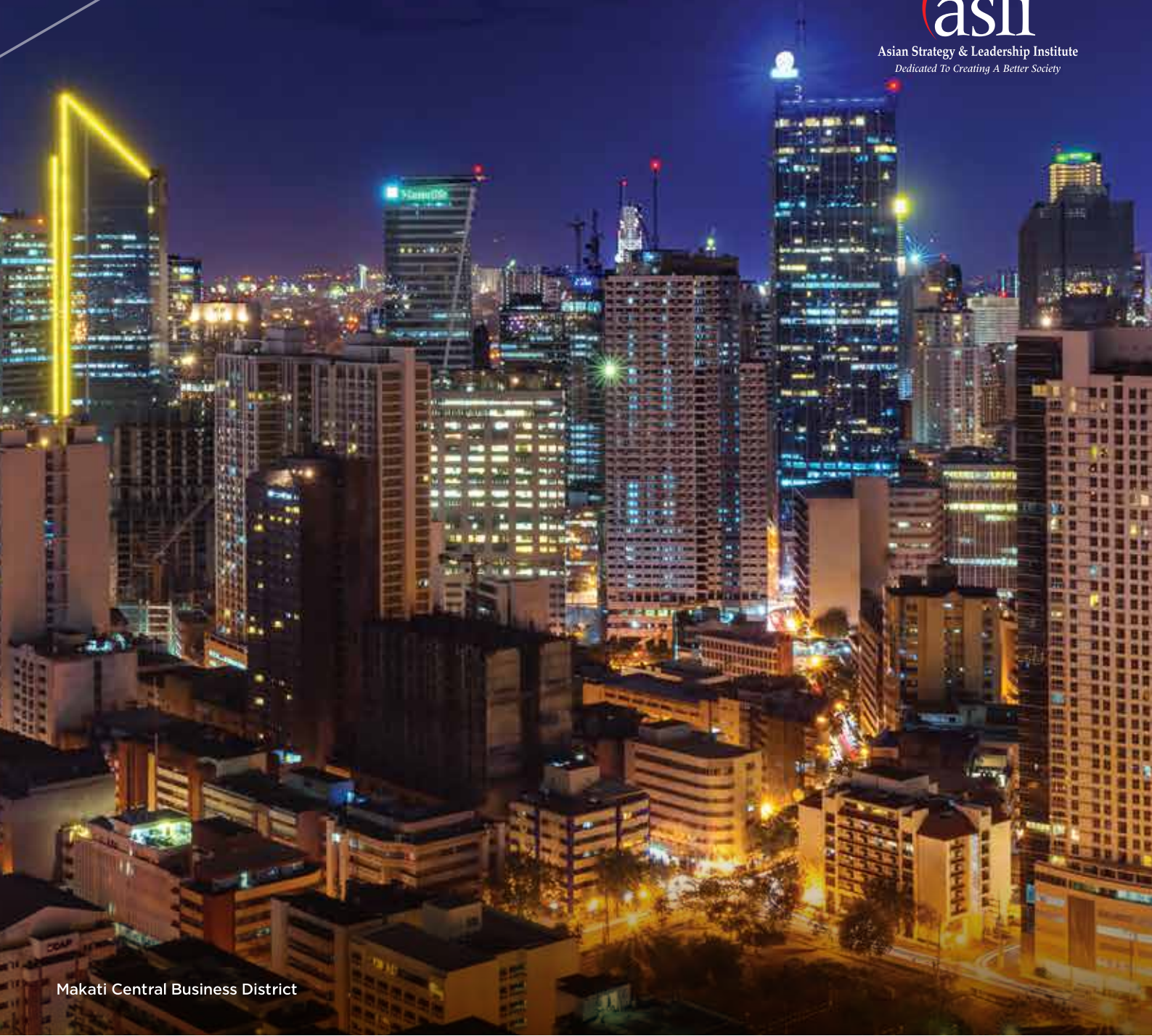
Makati Central Business District

Asian Strategy & Leadership Institute Dedicated To Creating A Better Society