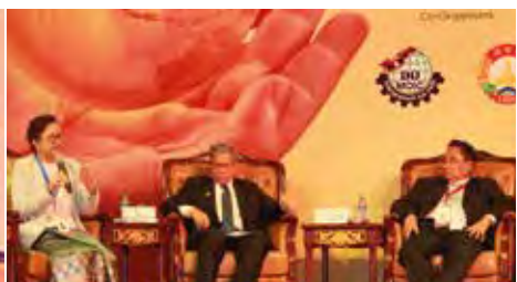
H. E. Mrs Khemmani Pholsena, Minister of Industry and Commerce of Lao People's Democratic Republic delivering her remarks whilst The Hon. Dato' Sri Mustapa Mohamed, Minister of International Trade & Industry (MITI) and H. E. Dr. Than Myint, Minister of Commerce of Republic of the Union of Myanmar looked on