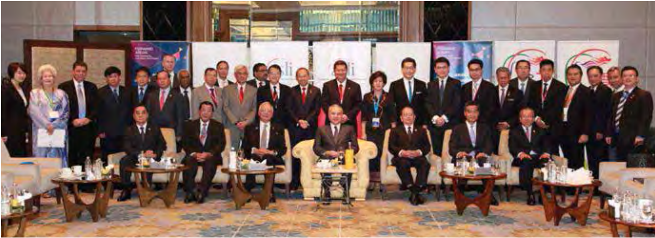
Seated are The Prime Ministers of Lao PDR, Cambodia and Malaysia; HRH Sultan of Perak Sultan Nazrin Muizzuddin Shah; President of Myanmar; Chief Executive of Hong Kong Special Administrative Region and Representative of the Philippines President, Trade Secretary Gregory Domingo.